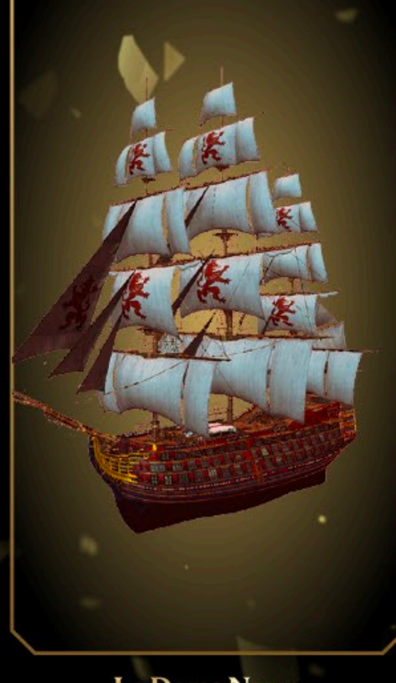
La Dama Negra

Edward Thatch, an iconic pirate more commonly known as Blackbeard. The ship he commandeered was called: