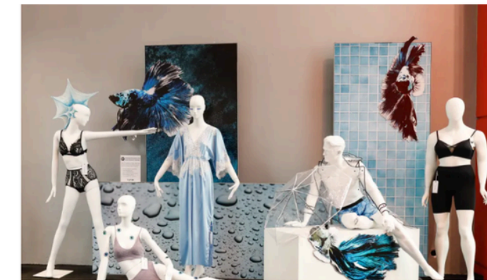
Curve is returning to the Javits Center Aug. 3 to 5.