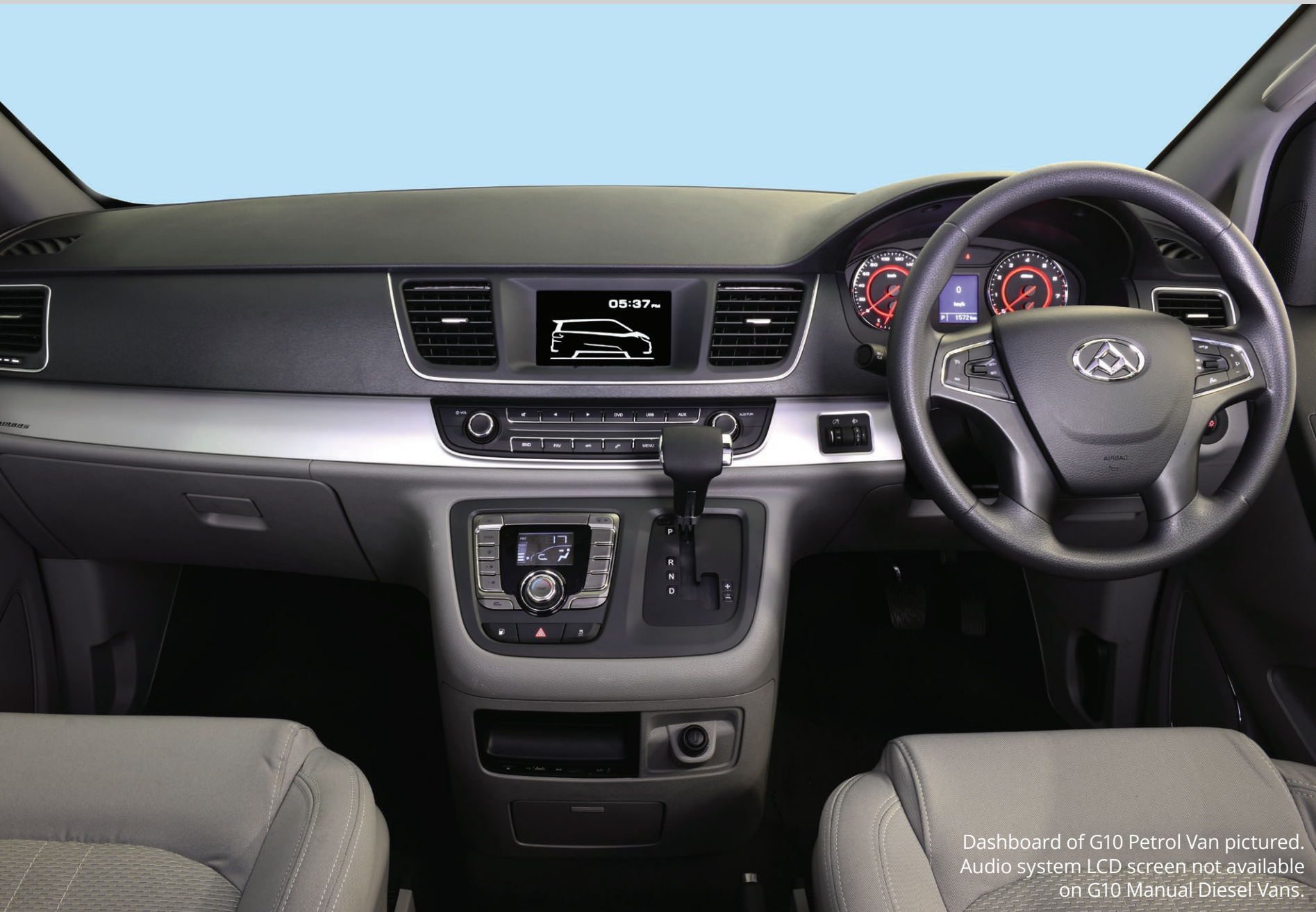
Dashboard of G10 Petrol Van pictured. Audio system LCD screen not available on G10 Manual Diesel Vans.