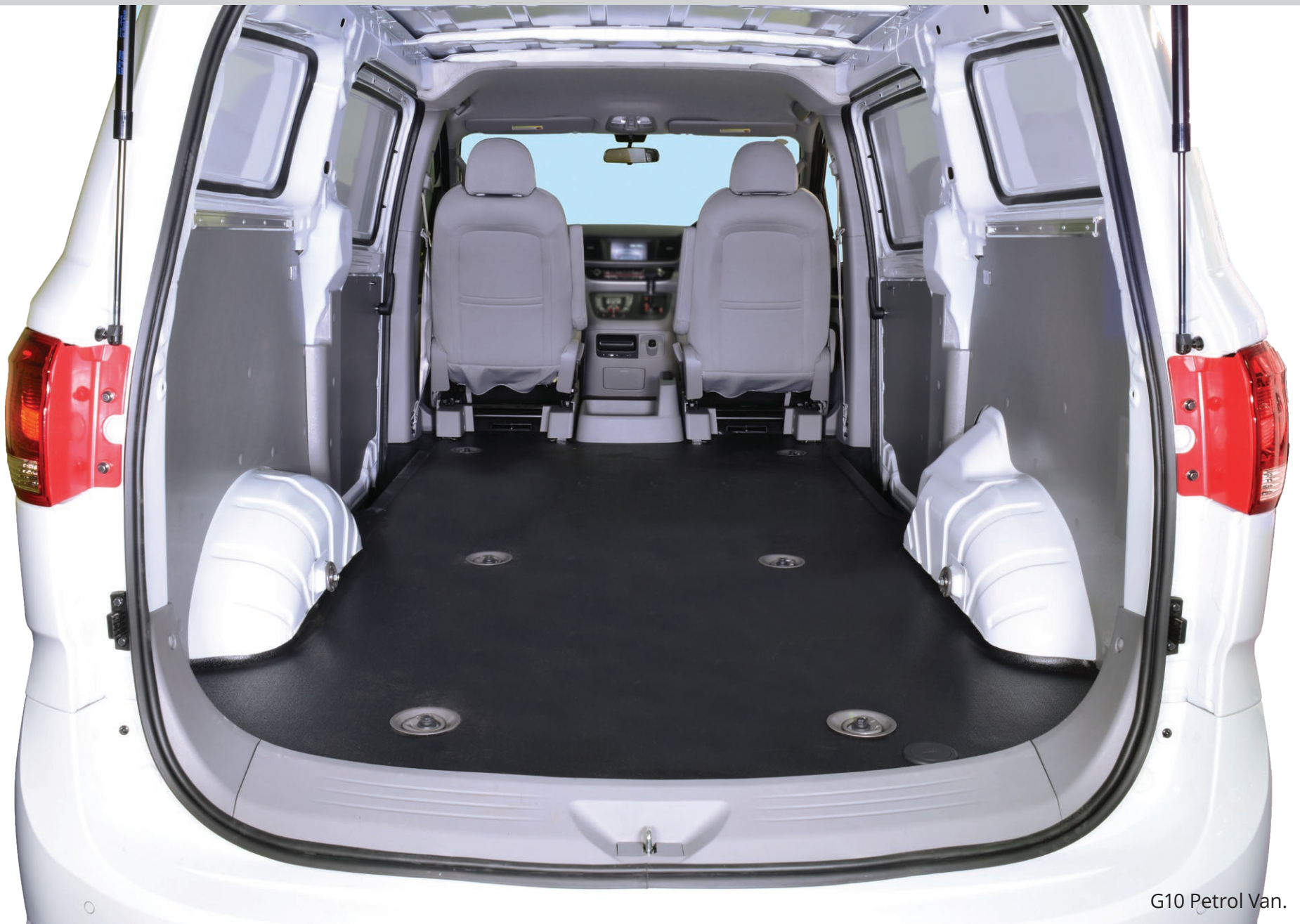
G10 Petrol Van.