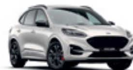
White Platinum *^