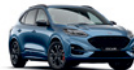
Blue Metallic ++