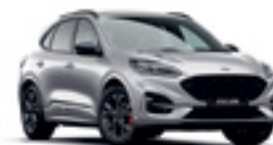
Moondust Silver ++