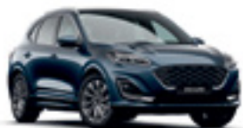
Blue Panther *~