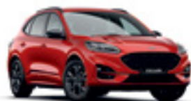
Lucid Red *^