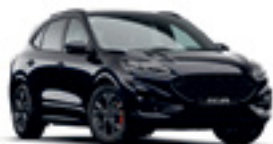
Agate Black ^