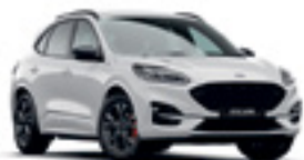
Frozen White +

*Prestige Paint is an option that incurs an additional charge ^Available on all models +Available on Escape and ST-Line models only ~Available on Vignale only