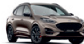
Diffused Silver ++