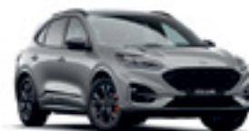
Solar Silver *^