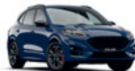
Blazer Blue +