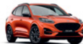
Sedona Orange ++