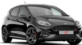
Agate Black Metallic*