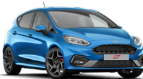
Ford Performance Blue*