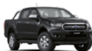
XLT in Shadow Black*