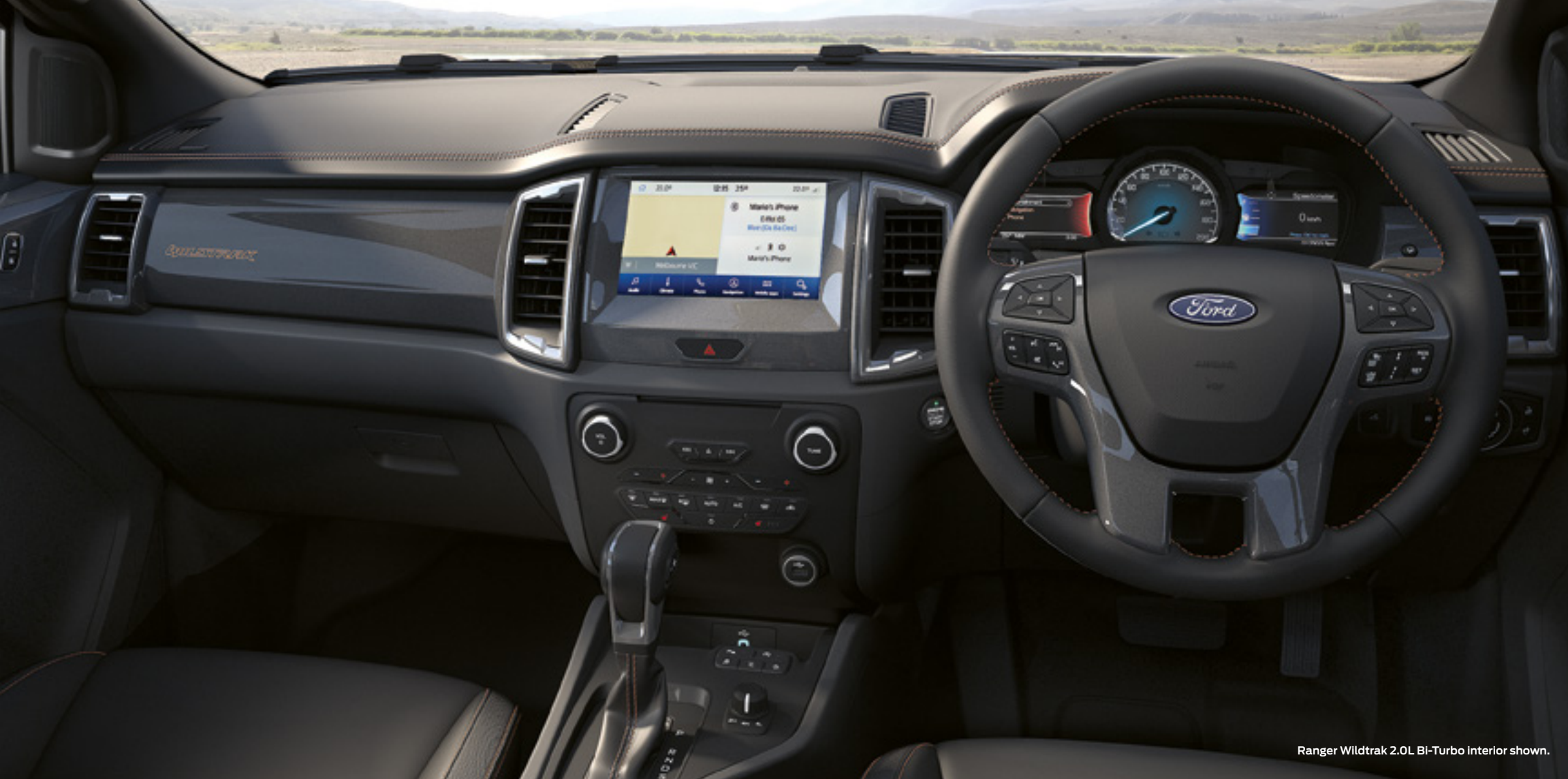
Ranger Wildtrak 2.0L Bi-Turbo interior shown.