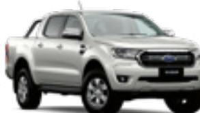
XLT in Alabaster White*~