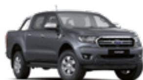
XLT in Meteor Grey*