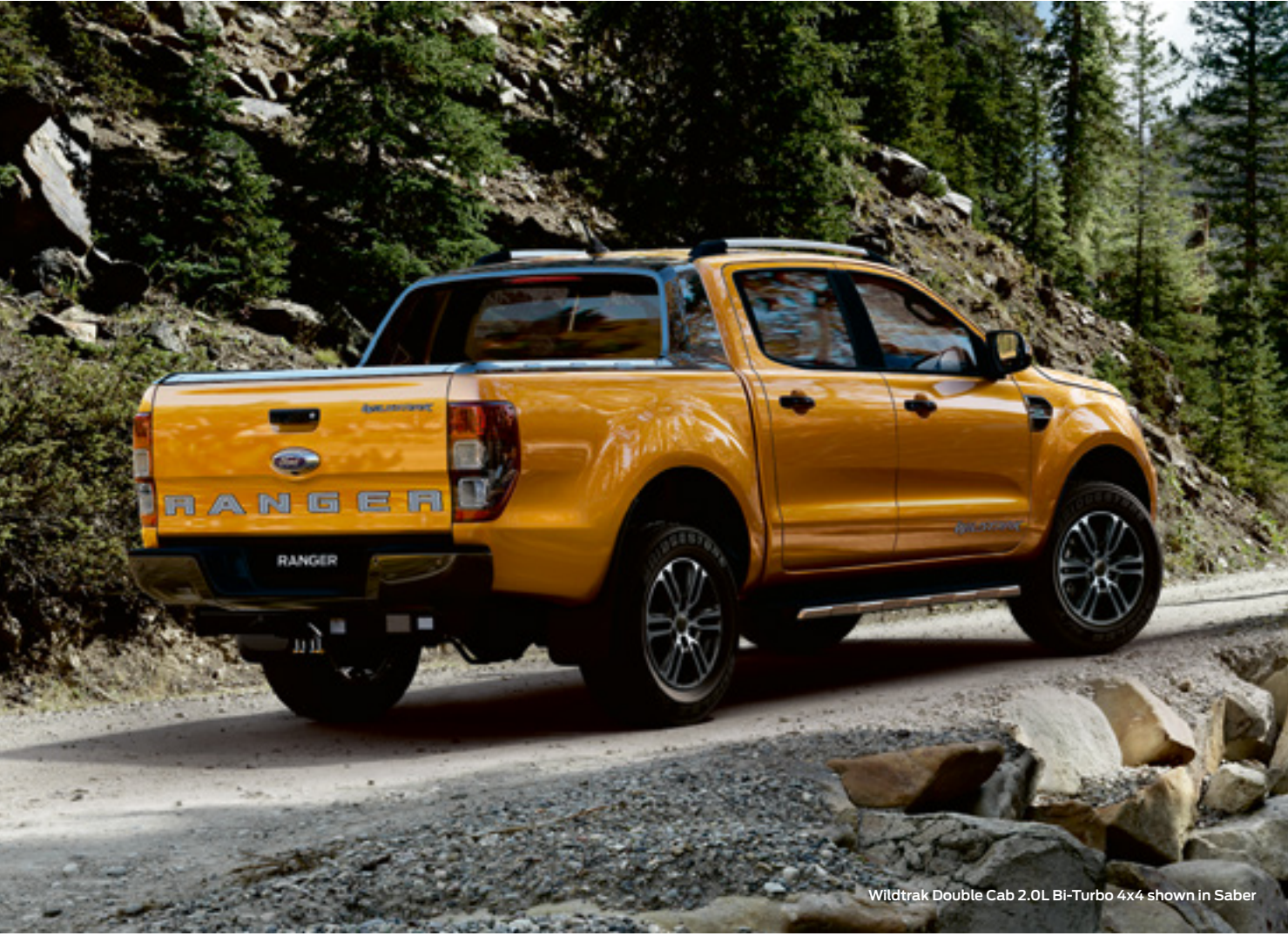
Wildtrak Double Cab 2.0L Bi-Turbo 4x4 shown in Saber