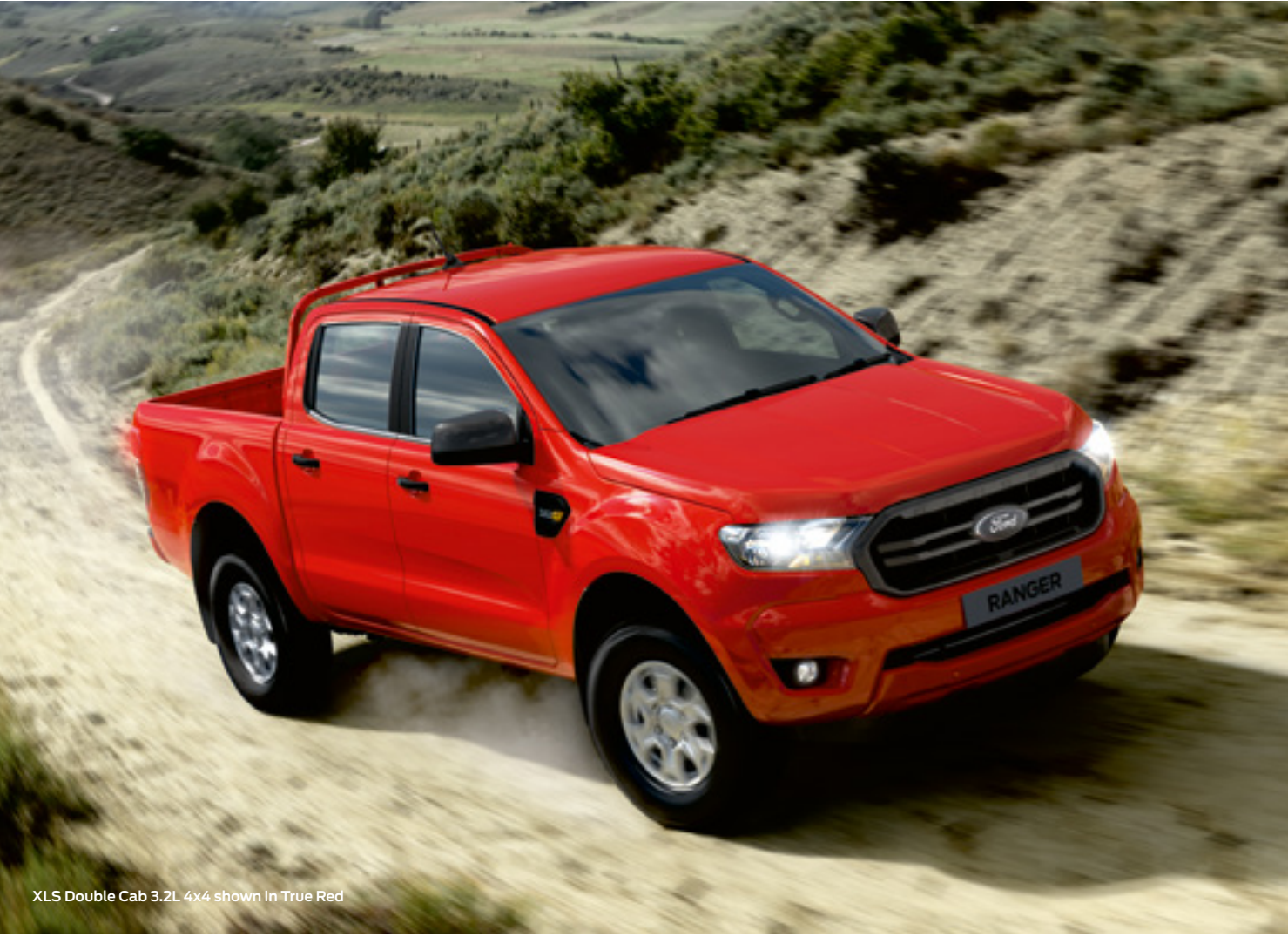
XLS Double Cab 3.2L 4x4 shown in True Red