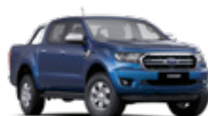
XLT in Blue Lightning†