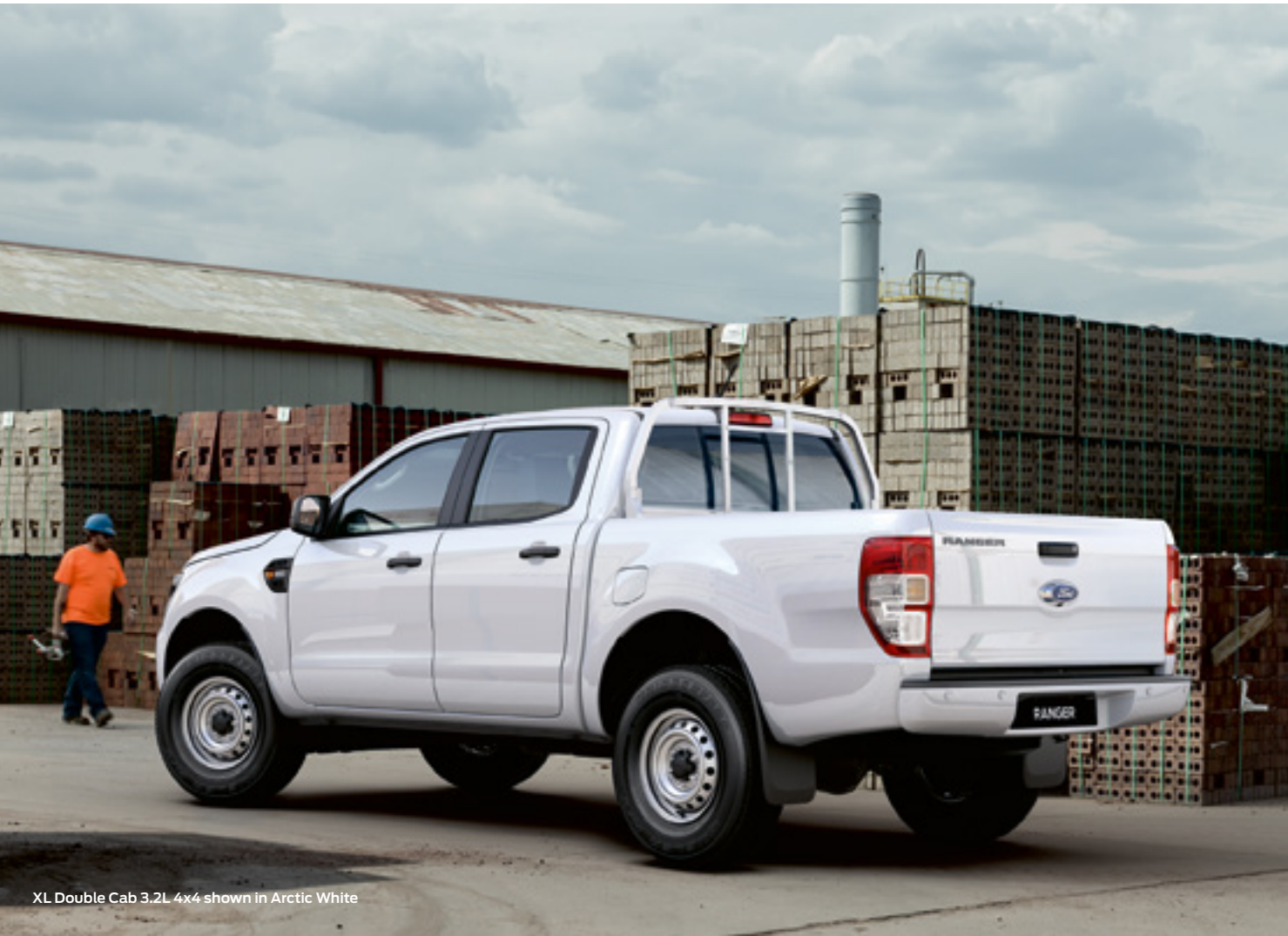
XL Double Cab 3.2L 4x4 shown in Arctic White