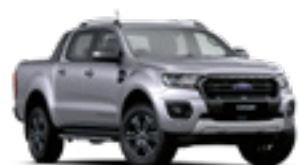
Wildtrak in Aluminium Silver*