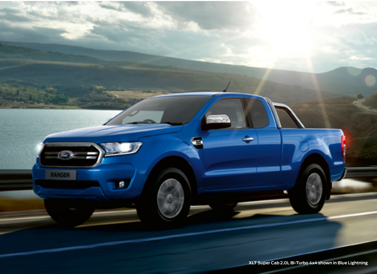
XLT Super Cab 2.0L Bi-Turbo 4x4 shown in Blue Lightning