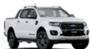
Wildtrak in Arctic White

*Prestige Paint ^Wildtrak exclusive colour †Not available on Wildtrak ~XLT & Wildtrak exclusive colour