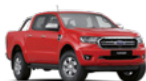
XLT in True Red†