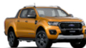
Wildtrak in Saber^^