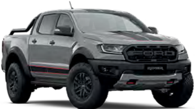
Conquer Grey 3