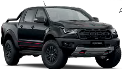
Shadow Black 3