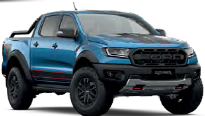
Ford Performance Blue 3