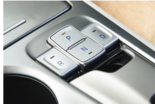
Top: Heated and air ventilated front seats¹ Bottom: Shift By Wire (SBW)