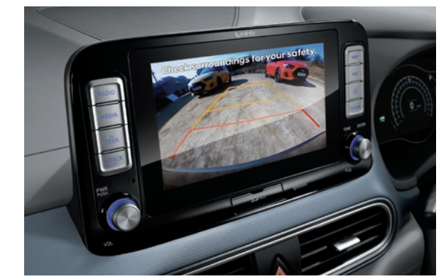
Rear view camera<sup>3</sup>

It includes: Blind-Spot Collision Warning (BCW), Driver Attention Warning (DAW), Forward Collision-Avoidance Assist (FCA), High Beam Assist (HBA)<sup>2</sup>, Lane Keeping Assist (LKA), Rear Cross-Traffic Collision Warning (RCCW) and Smart Cruise Control (SCC) with Stop and Go.