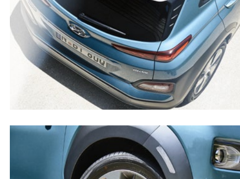
Top: Two-tone coloured roof<sup>1</sup> Bottom: Alloy wheels