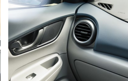
Top: Bridge-type centre console<sup>3</sup> Bottom: Two-tone interior (stone-grey/blue)<sup>4</sup>