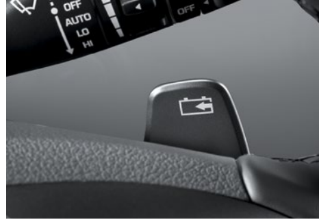
Paddle shifters - regenerative braking control