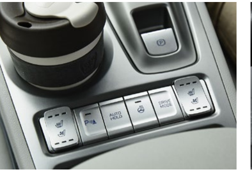
Drive modes - Eco, ECO+, Comfort & Sport<sup>2</sup>

The Kona Electric has exceptional noise vibration handling, making the car extremely quiet. That's why we have the Virtual Engine Sound System (VESS), a fun feature you can use to generate melodic driving sounds which also helps with pedestrian safety.