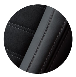
» Cloth and synthetic leather trim.

+ EV Remote Control System + Push-Button Start + Forward Collision Mitigation + Adaptive Cruise Control + Lane Departure Warning + Auto High Beam