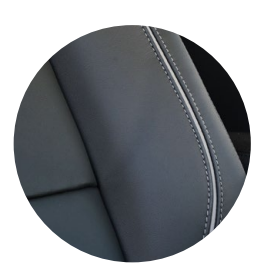
» Leather trim.