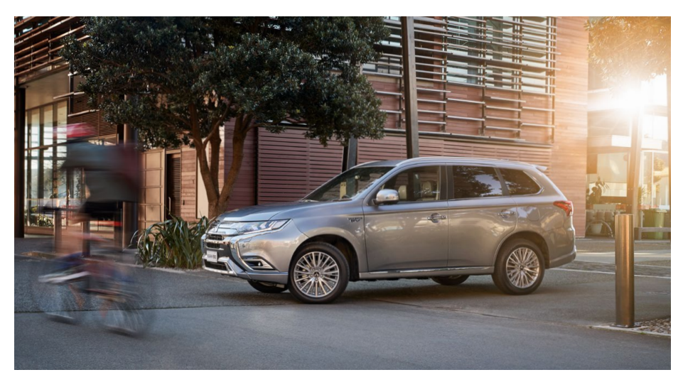
» ALWAYS WATCHING Sonic warning for pedestrians and a suite of advanced sensors constantly monitor your conditions.

Inside, you're kept safe by 7 airbags and a rigid body design that absorbs energy. Even the battery is enclosed in a strong casing that's withstood conditions you're never likely to encounter. The 5-star safety standard is easily achieved by all models.