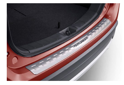
» REAR BUMPER SCUFF PLATE