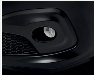
Front Fog Lights