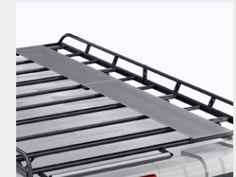
Steel Walkway (Barn Doors, SWB & LWB)