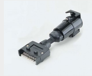
7 Pin to Round Large Trailer Plug