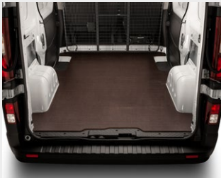
Wood Flooring – 2 Sliding Doors (SWB & LWB)