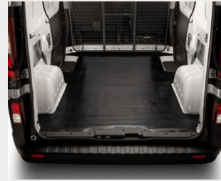
Rubber Cargo Mat (SWB & LWB)