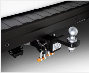
Towbar Kits, to suit with and without Rear Step