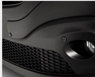
Front Park Assist