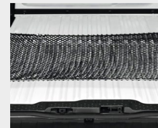
Horizontal Cargo Net