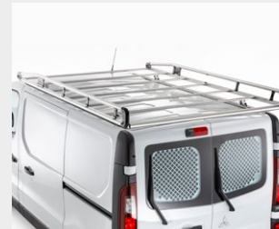
Aluminium Roof Rack with Roller (SWB & LWB)