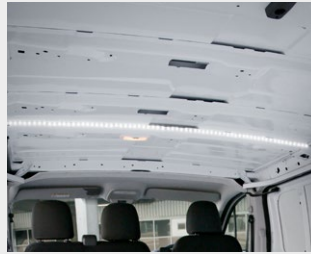
LED Interior Lights