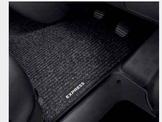
Carpet Floor Mats (Front)