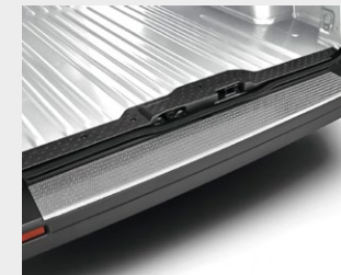
Cargo Entry Protector