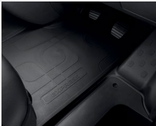
Rubber Floor Mats (Front)