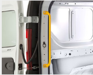
D-Pillar Support handle