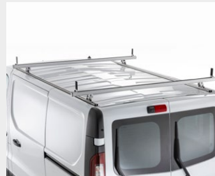
Aluminium Roof Bars (Pair) with Stops (SWB & LWB)