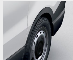
Rear Wheel Arch Protector