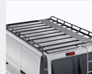
Steel Roof Rack (Barn Doors, SWB & LWB)