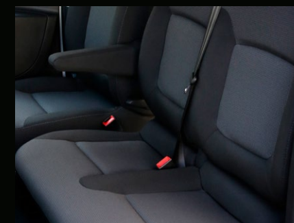
Black bolster with grey facing seat fabric