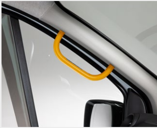
A-Pillar Support Handle