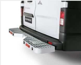
Rear Step with Towbar