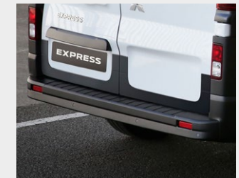
Barn Doors Protector