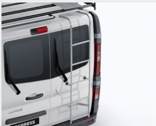
Galvanised Steel Ladder (Barn Doors)