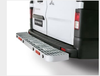
Rear Step without Towbar