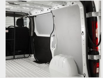
Wood Wall Panels – 2 Sliding Doors (SWB & LWB)