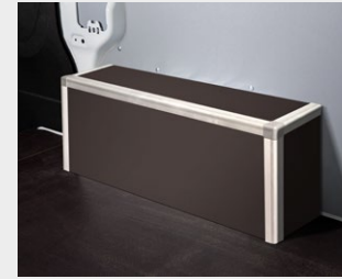
Wood Wheel Arch Protector (SWB & LWB)