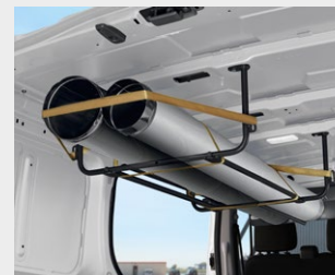
Interior Roof Rack (SWB)