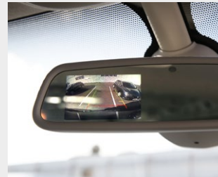
Mirror Rear View Camera