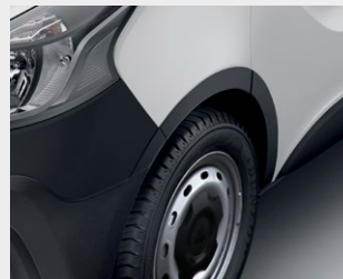
Front Wheel Arch Protector