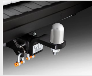
Tow Ball Cover