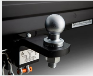
50mm Towball – Chrome