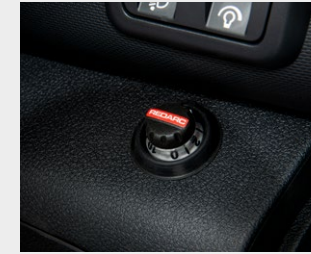
Electric Trailer Brake Kit