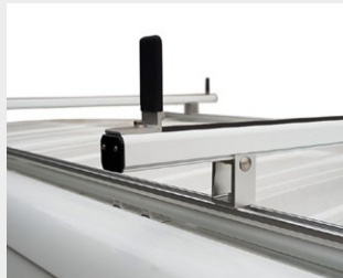
Aluminium Roof Bar with Stop (SWB & LWB)