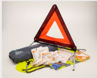
Safety & First Aid Kit

MITSUBISHI DIAMOND ADVANTAGE GENUINE ACCESSORIES