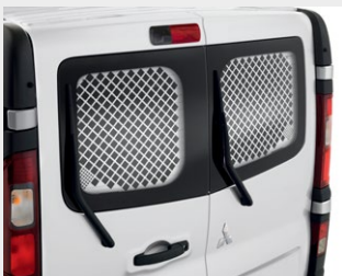
Barn Door Window Protection Grille