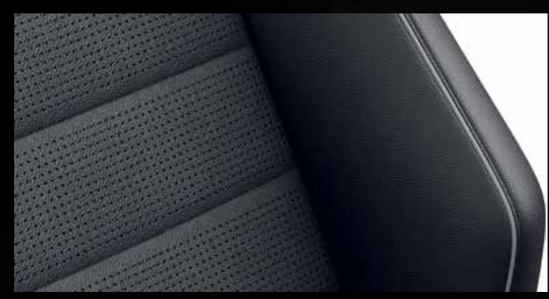
Black Vienna leather seat upholstery# (Standard on Golf R and optional on Golf GTI*)

Black/Red 'Clark' sports cloth seat upholstery (Golf GTI only)