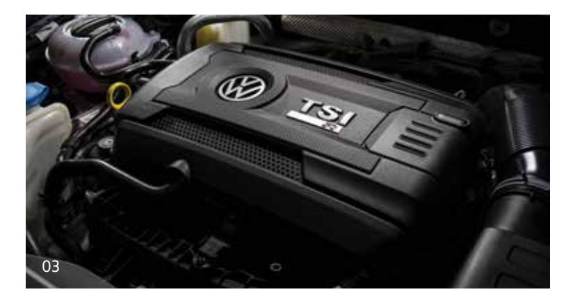
01 Golf GTI infotainment screen with App-Connect<sup>~</sup> featuring Apple CarPlay<sup>®</sup> 02 Golf R infotainment screen with performance monitor 03 2.0-litre turbocharged TSI engine