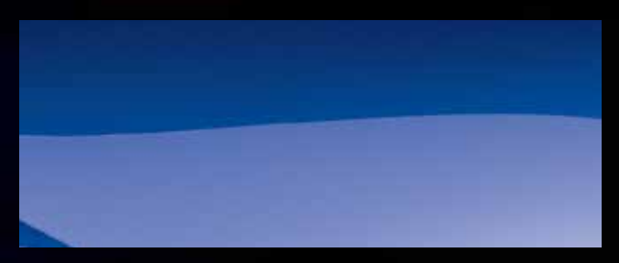
Lapiz Blue Metallic (available on Golf R only)