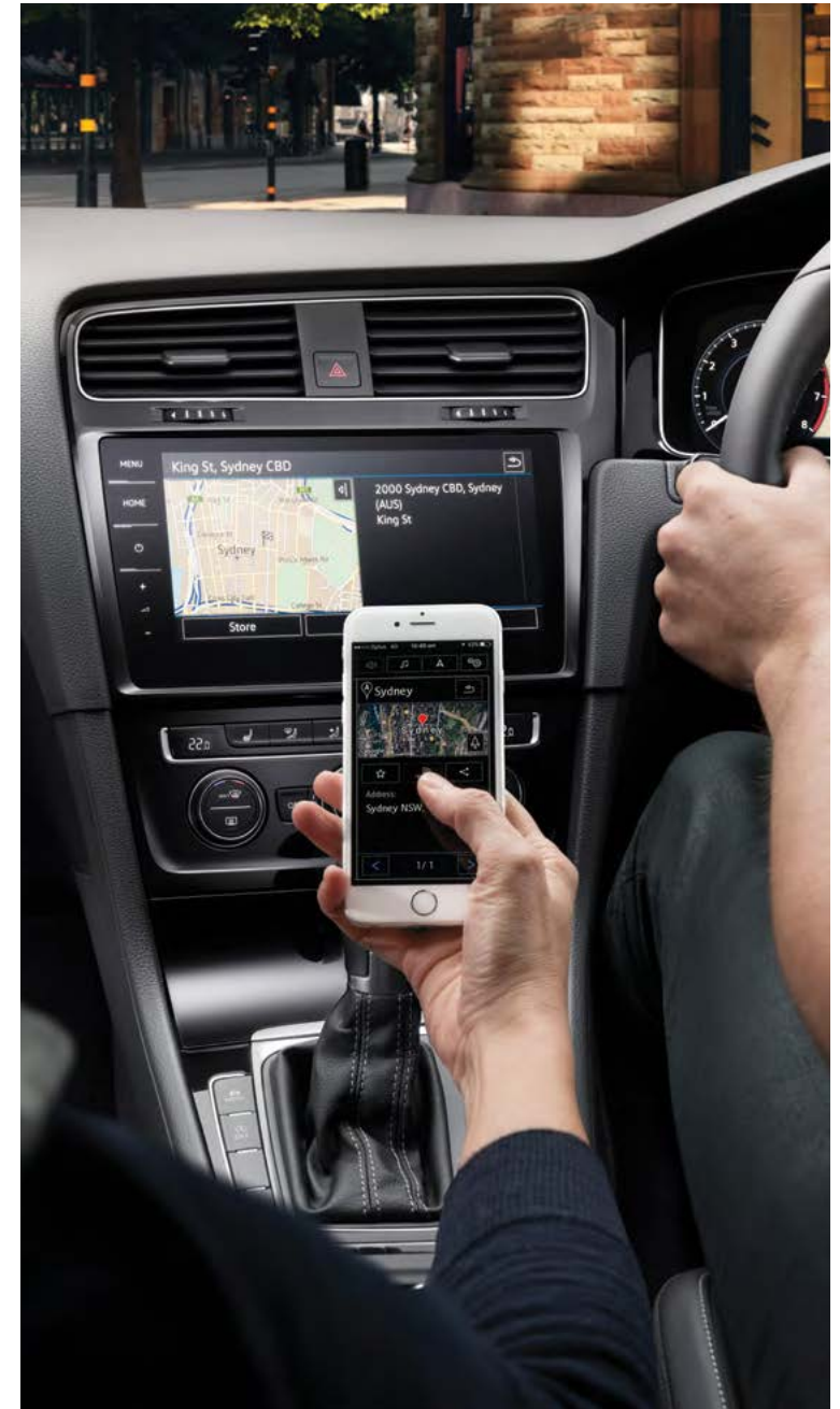
Media Control shown

With its evolutionary styling, impressive level of driver safety equipment as standard, and exceptional performance and comfort, the Golf once again sets the benchmark high.