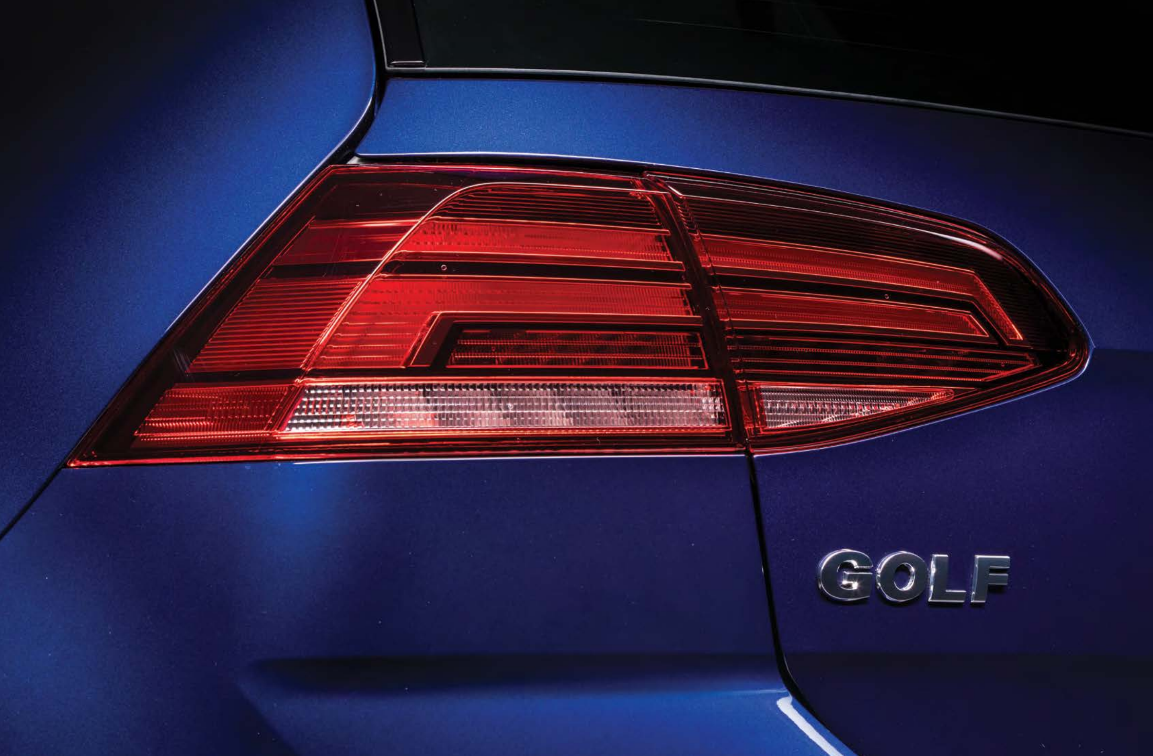
Highline with R-Line Package shown