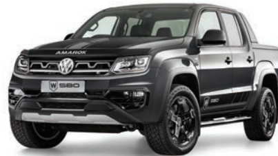
Indium Grey (PE)