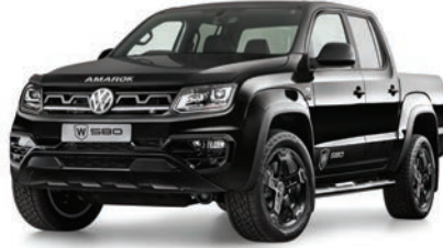
Deep Black (MP)*