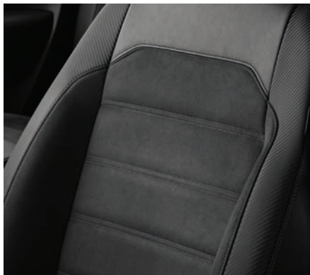
Art Velour Trim

Two-colour microfleece seat upholstery in Palladium/Titanium Black