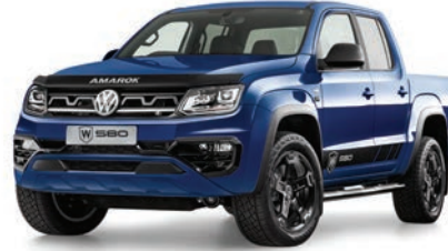
Ravenna Blue (PE)*