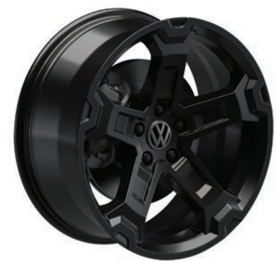
20" x 9" forged 'Clayton' Alloy Wheels

Two-colour Vienna Leather# upholstery in Palladium Grey /Titanium Black