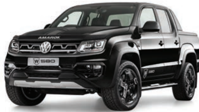
Deep Black (PE)