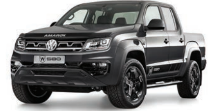
Indium Grey (MP)*