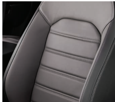
Vienna Leather# Trim

Two-colour microfleece seat upholstery in Palladium/Titanium Black