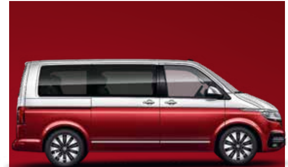
Reflex Silver Metallic / Fortana Red Metallic