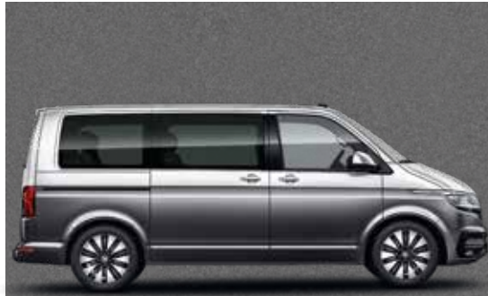
Reflex Silver Metallic / Indium Grey Metallic