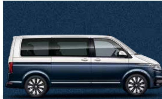
Reflex Silver Metallic / Starlight Blue Metallic