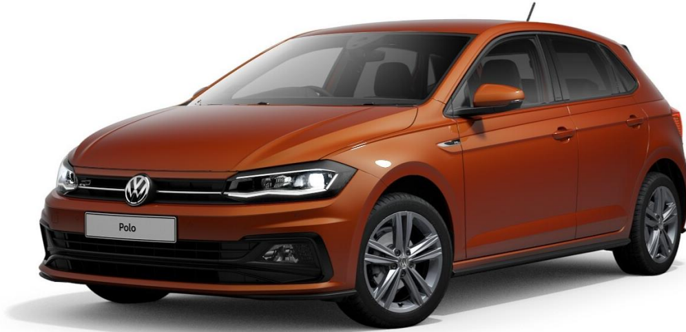
TSI R-Line DSG shown