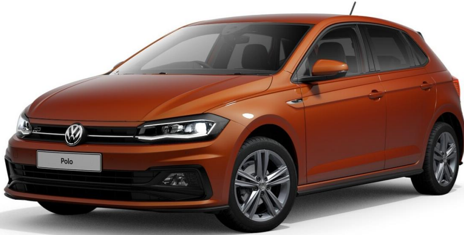
TSI R-Line DSG shown