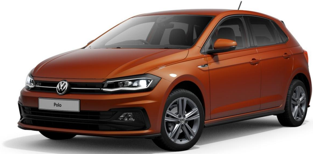
TSI R-Line DSG shown