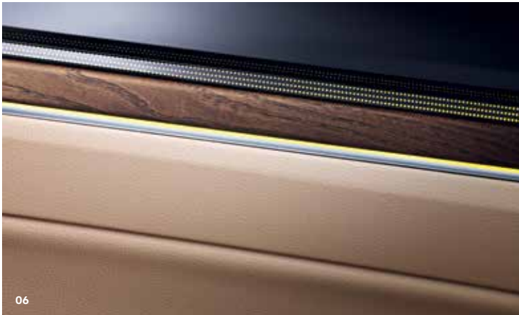
06 The new Touareg redefines ambience with its range of 30 different colours for the background lighting.

A wide array of customisation options make sure the interior of the Touareg lives up to your high expectations but also your personal preferences. New decorative inserts, and trim including a new, optional pneumatic massage chair function is featured for the first time in the Touareg. Users can select from eight modes that offer variable control of intensity and are implemented by individual air cushions. The spacious interior of the Volkswagen Touareg remains a luxurious comfort zone. The rear seating system provides 160 mm of longitudinal adjustment to create even more space at the rear. Cargo capacity is also increased to 810 litres in the new VW Touareg. This offers 113 extra litres of boot capacity than the previous model.