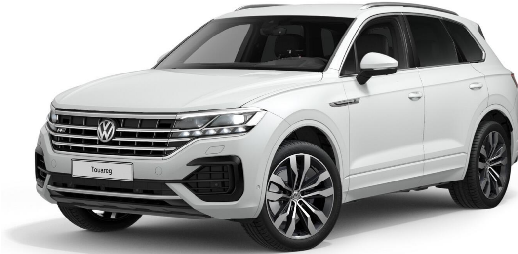
TDI V6S R-Line shown