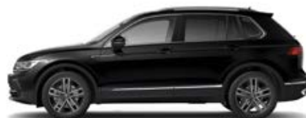
Deep Black Pearl Effect