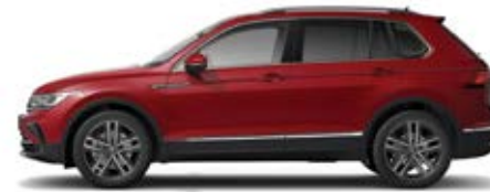
Kings Red M