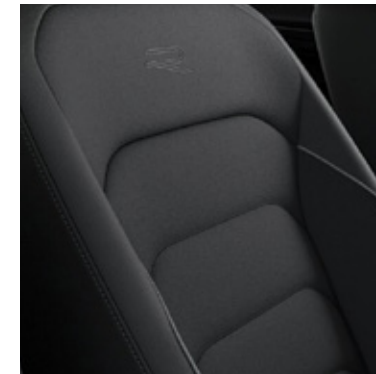
Tiguan R-Line models Black R-Line Vienna leather #

Please note that Metallic, Pearl Effect, Premium and Premium Metallic paint are optional at extra cost. The print process does not allow for exact reproduction of the exterior or the upholstery colours.