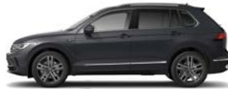
Dolphin Grey M