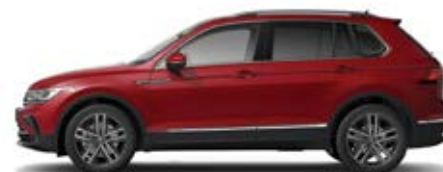
Kings Red Metallic