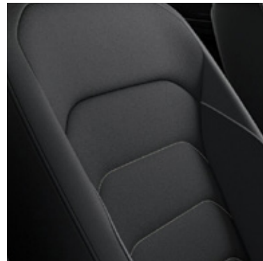
Tiguan Elegance models Black Vienna leather #