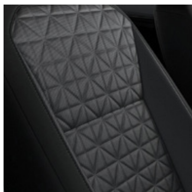
Tiguan Life models Black Comfort Cloth