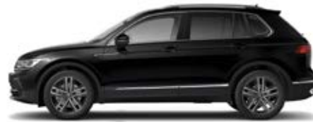
Deep Black PE