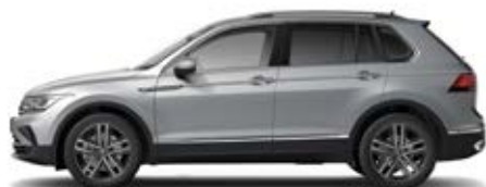
Reflex Silver Metallic