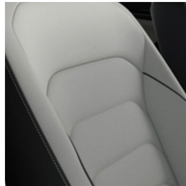
Tiguan Elegance models Optional Storm Grey leather #