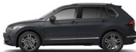
Dolphin Grey Metallic