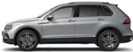
Reflex Silver M