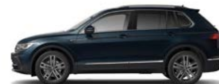
Night Shade Blue Metallic