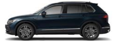
Night Shade Blue M