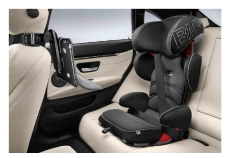
BMW Junior seat 2/3 black