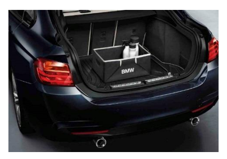
BMW Luggage Compartment mat & BMW folding box