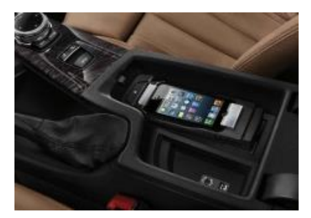
Snap in Adapter for iPhone, Samsung and HTC one