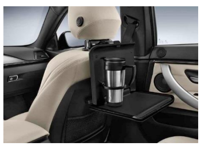
BMW Travel and Comfort folding table

For more information, please contact your preferred BMW Dealer who will be pleased to advise you on the full range of Genuine BMW Accessories, or visit bmw.co.nz/accessories .