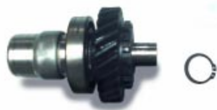
New input shaft & stock parts assembled.

SPECIAL NOTE: The components packaged in this kit have been assembled and machined for specific type of conversions. Modifications to any of the components will void any possible warranty or return privileges. If you do not fully understand modifications or changes that will be required to complete your conversion, we strongly recommend that you contact our sales department for more information. This instruction sheet is only to be used for the assembly of Advance Adapter components. We recommend that a service manual pertaining to your vehicle be obtained for specific torque values, wiring diagrams and other related equipment. These manuals are normally available at automotive dealerships and parts stores.