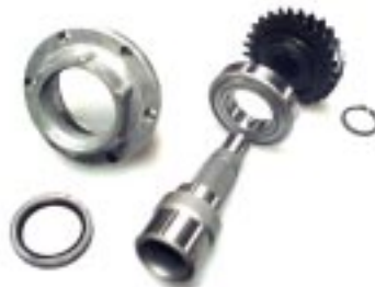
AA shaft & bearing with stock parts