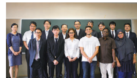
Students entered in September 2015 and Supervisors

https://www.sophia.ac.jp/eng/studentlife/index.html