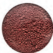
MINERAL MAX™ WITH RUMENSIN™

(Colours of the products are indicative only)