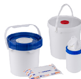
Different packaging available on demand