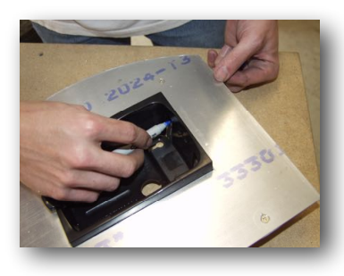
Step 6: Drill the holes