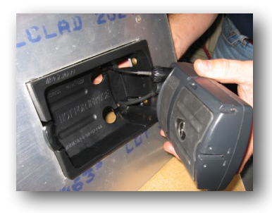
Step 8: Install cables

The Panel Dock has been designed to allow the cables that are included with the GPS to be used. There are "keyholes" in the back of the Panel Dock to allow the cables to be inserted with the unique feature of keeping the cables from disappearing behind the panel when the GPS is removed. If desired, you may cover the larger holes using rubber grommets.