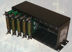
SRU 10 Ten Card Enclosure