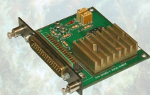
SA 3/SA 3L/SA 3NVG