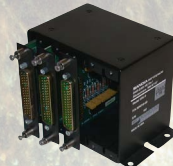
SRU 5 Five Card Enclosure