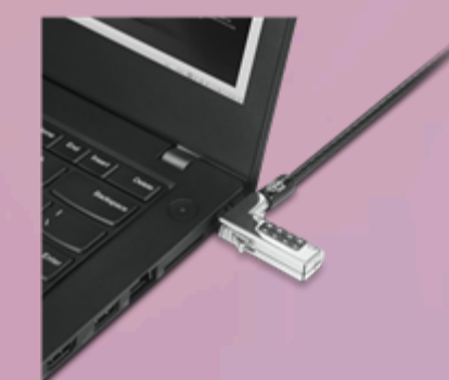
Combination Cable Lock from Lenovo 4XE1F30278

Please click here to view the full list of accessories.