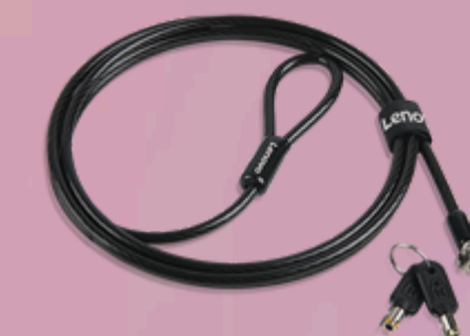
Kensington MicroSaver DS 2.0 Cable Lock from Lenovo 4XE1L68273