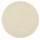
Polishing Felt Pad White, 2/Pack 125x6 mm Grip