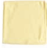
Cleaning Cloth 330x330 mm Yellow, 2/Pack

A flat hard 6 mm thick white felt pad, designed for glass polishing applications. The thick felt pad construction has a good balance and feels stable during polishing. The pad is designed to be used in combination with Polarshine E3 polishing compound and that combination provides a good glass sanding process.