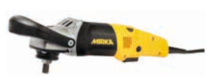
Mirka® PS 1437 Polisher 150 mm

A yellow soft micro fiber cloth, with a fine texture. Absorbs residue well and is washable.