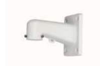
DH-PFB305W Wall mount bracket