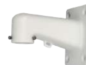
DH-PFB305W Wall Mount Bracket