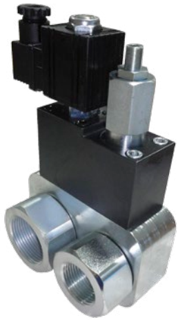
Con limitadora With relief valve