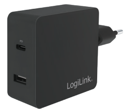
PA0212 USB-C™ 2-Port Wall Charger