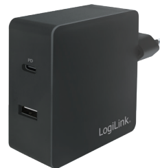
PA0213 USB-C™ 2-Port Wall Charger