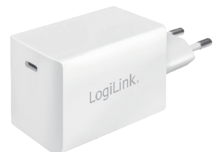
PA0229 USB-C™ GaN Wall Charger