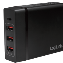
PA0122 USB Table Charger