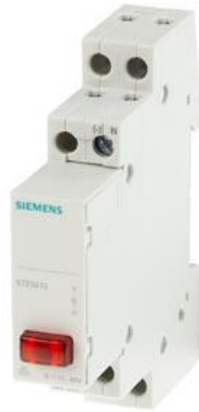
Indicator light 1 lamp 230 V red