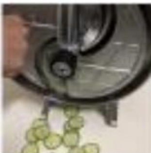
Cut the cucumber