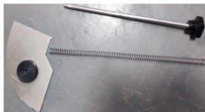
Removed push plate, pull rod, spring