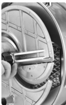
Remove cutter head