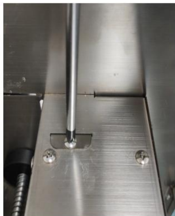
Just remove the safety buckle