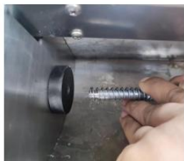
Screw out the pull

First, you need to remove the cutter head and then remove the tie rod tail pentagram; the push plate can be removed to replace the spring. Replace the spring, install the return groove on the push rod, fix it in place with the pentagram, and install the cutter head. Lock the cutter head with the safety buckle for normal use.