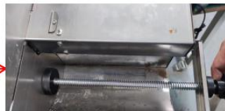
Replace the spring and install it back the same