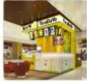
Milk tea shop