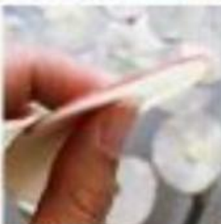
Cut the apple