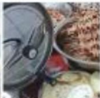
Cut Lotus root