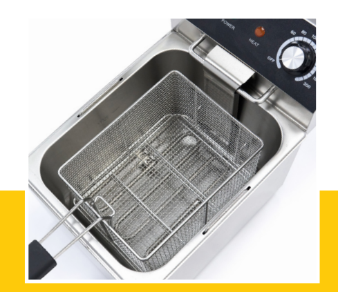
Protected heating elements and adjustable thermostat