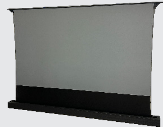
UST-ALR motorised ascending screen ultra-discreet