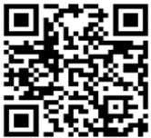
Scan QR Code for authenticity

Product Name: Hemp Drops 1000mg CBD RAW Product Type: Liquid HS Code: 2907 29 - Polyphenols CAS #: 89958-21-4 Batch Number: Batch 118 Manufacture Date: 12/01/2021