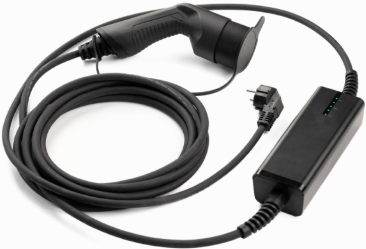
BN20 Low power(8A-16A)