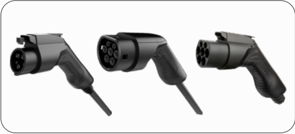
Type 1, Type 2, GB/T