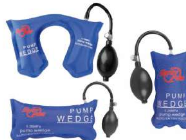
MPT-A001/ MPT-A018/ MPT-A003

[Usage]: (Inflation) Tighten the air valve and press the inflatable ball several times until the air bag is full. (Deflate) Just open the air valve surface.