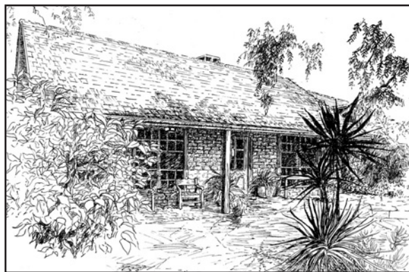
Illustration: Gail Lucas