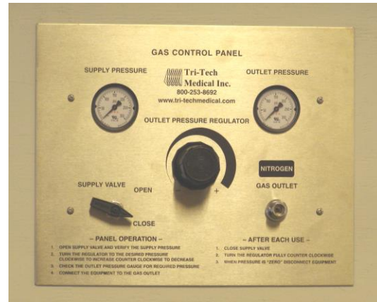
NP100 – Nitrogen Gas Control Panel Shown

The gas control panel shall be factory piped and 100% tested. All components shall be panel mounted on a stainless steel, silk-screened front panel.