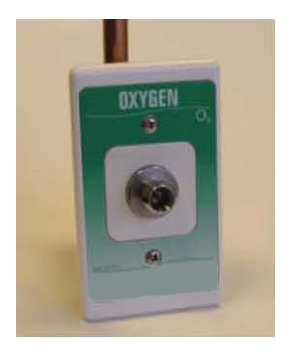
XF5724A with XC1000-10 trim plate

Medical gas outlets shall be cleaned for oxygen service in accordance with the current Compressed Gas Association (CGA) Pamphlet G-4.1, capped and placed in a protective container for shipment. The outlets shall be installed in strict accordance with manufacturer's instructions, and tested before use in conformance with NFPA 99, local and state codes.