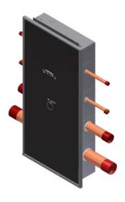
Shown above VU42A2N3O4V 4 valve box with gauges 1/2" Medical Air, 1/2" N2O, 3/4" Oxygen, 1" Medical Vacuum

Gauges shall be 1 ½" diameter for monitoring pressure and vacuum, and shall state: "USE NO OIL". Dual scale gauges are not acceptable for U.S.A. installations.