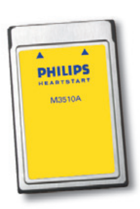
Data Card for 2 hours of event storage