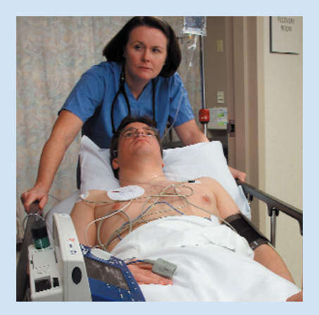
Compact and rugged, the HeartStart XL easily fits on a standard hospital stretcher and withstands the rigors of hospital use and patient transport.