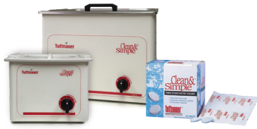
Clean&Simple™ Ultrasonic Cleaners and Tablets

For over 90 years, Tuttnauer's sterilization and infection control products have been trusted by hospitals, universities, research institutes, clinics and laboratories throughout the world. Supplying a range of top-quality products to over 100 countries. Tuttnauer has earned global recognition as a leader in sterilization and infection control.