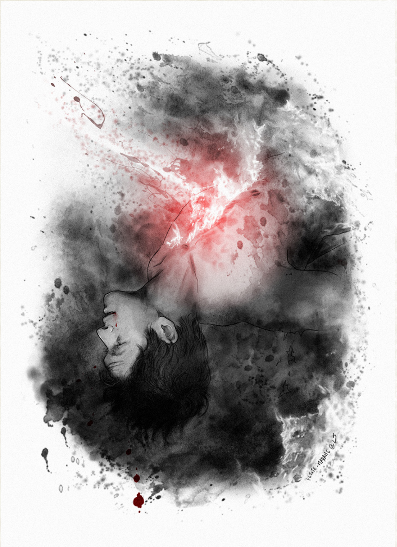
Disintegration © Petite-Madame | DA |