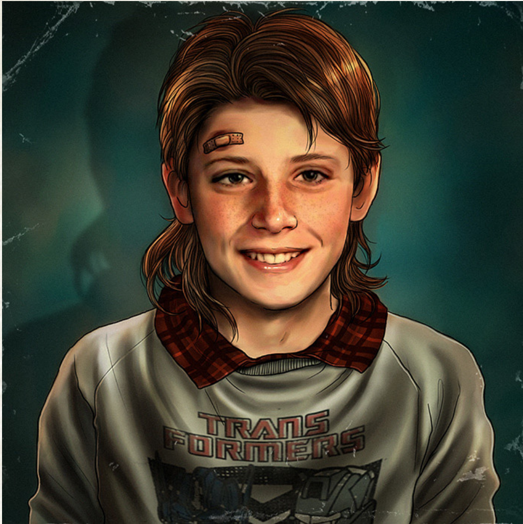
The Life of Dean Winchester | In | T

An ill-judged swipe at the jar sent it off the edge of the fridge. It fell to the counter, breaking. The boy was quickly down off the stool, fright taking him over. John Winchester stormed into the room, all fury and no restraint. Castiel watched serenely, unable to reach out and affect events in any way that either would remember. Part of him hoped that, somehow, the shared moment of mischief and being there with him, bearing witness and feeling for him—not pity or sorrow—but loving empathy, would, in some small way, reinforce the child's thus-far indomitable spirit.