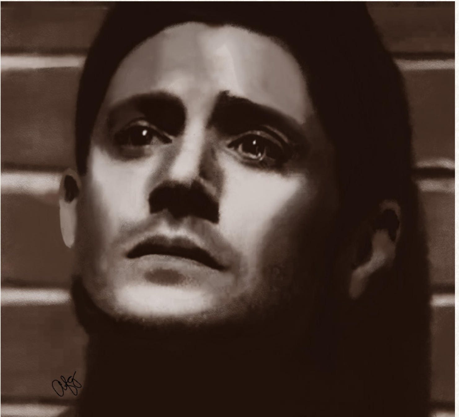
Missing You Already | T

it. I'm sorry. Peel away the stray flaps and shards, shave down loose splinters, neaten up edges, and make it presentable again. Make it look good again, so the rest of the world would never know just how badly mangled he was. Never let them see. Skin—bark—would heal, regrow, but that would never be enough to completely disguise the damage underneath. Not if anyone ever took a real good, hard, long look at it. So many scars had faded with time, but the hard nodules of changed flesh underneath were still there.