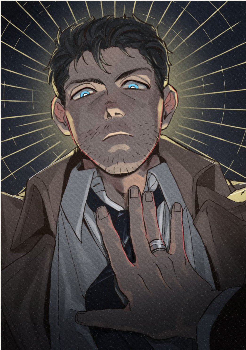
Watching Over You | Tw | T |