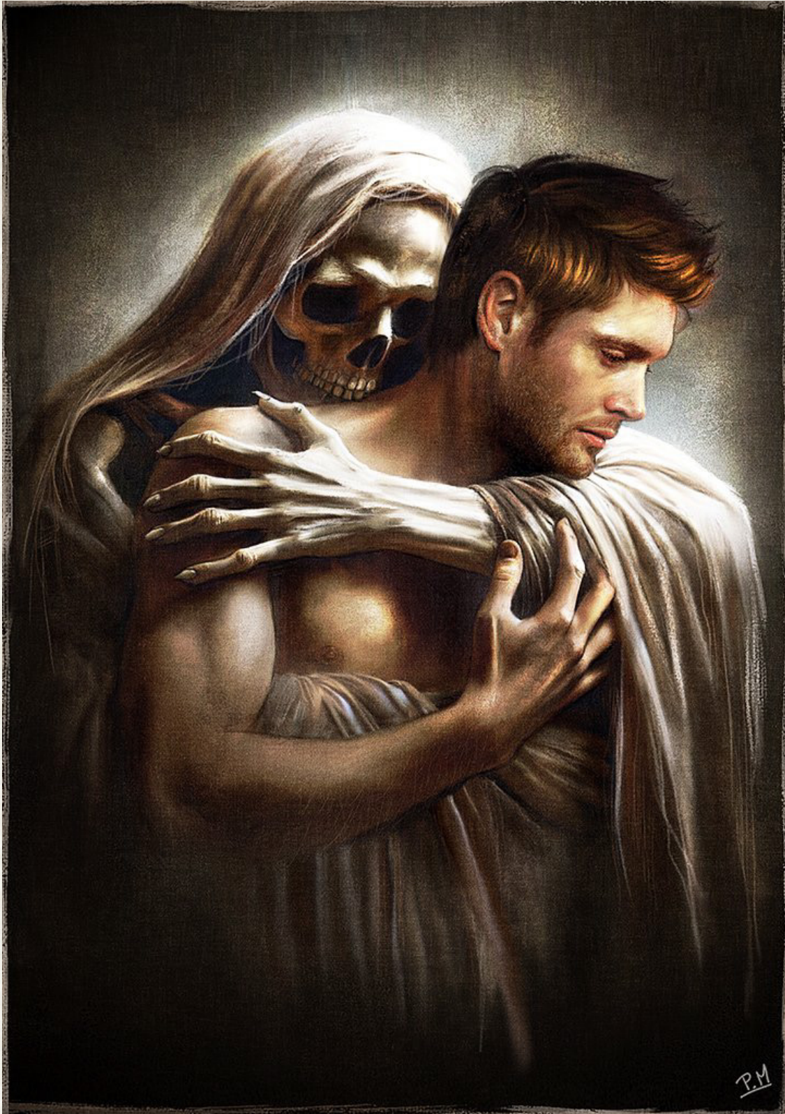
Death © 2025 Petite Madame | In | T | Tw |