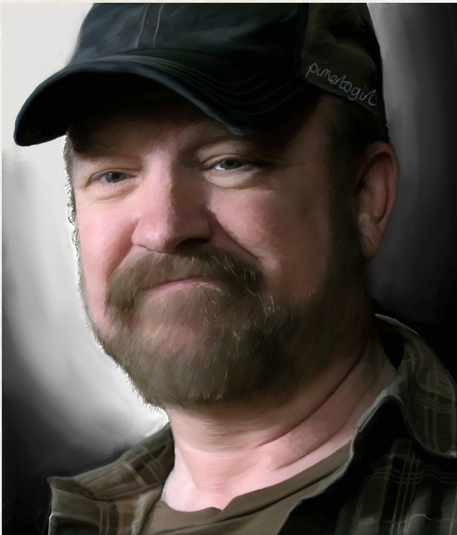
Bobby Singer © pimento-girl | DA | R | T |