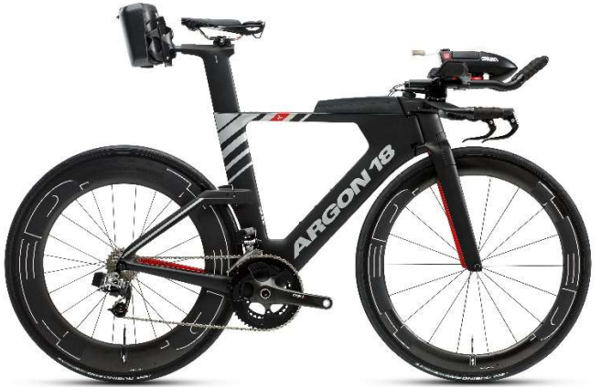
2019 E-119 Tri+ (284A)