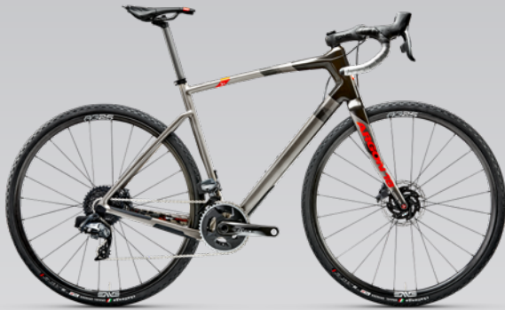
341A - HYPER-SILVER COAL BLACK

Ideal for gravel racers looking for poppy performance and nimble responsiveness on all terrain.