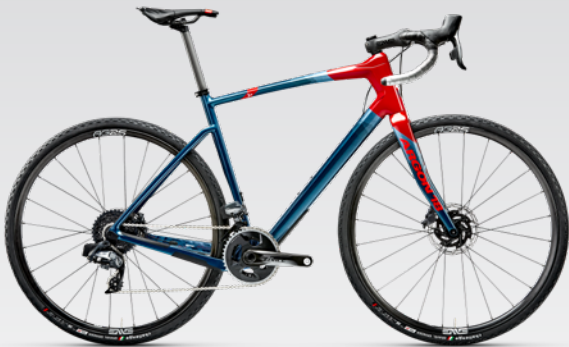
341B - DAWN BLUE DARK RED