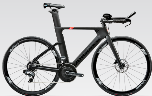
317B - BLACK ON BLACK