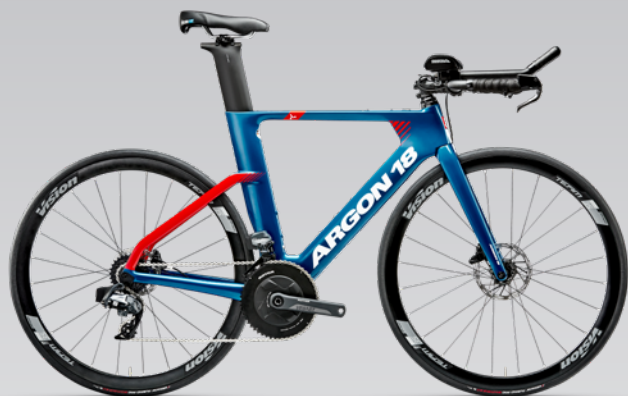
317A - OCEAN BLUE METALLIC

The committed age-grouper with a serious PB goal who wants the ultimate in handling and confidence.